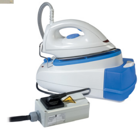
Connection box for earthed plug