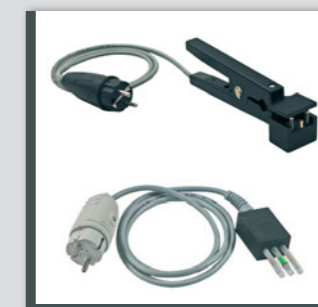
Clamp adapter/ luster terminal adapter