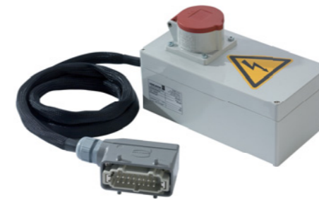
3-phase connection box