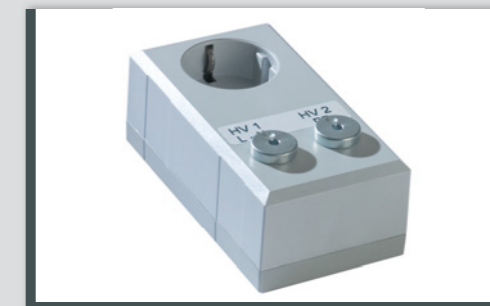
Adapter between test object and high-voltage test pistol