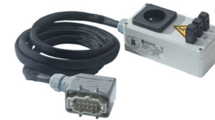
1-phase connection box with quick-fastening clamps